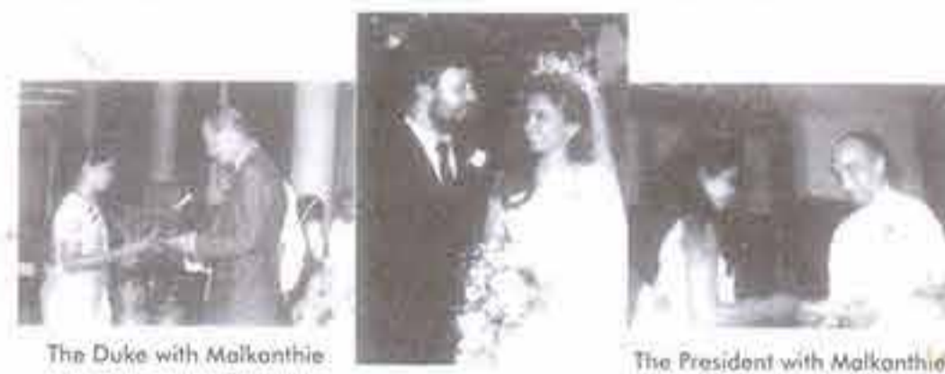
The Duke with Malkanthie